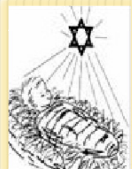
Birth of Jesus