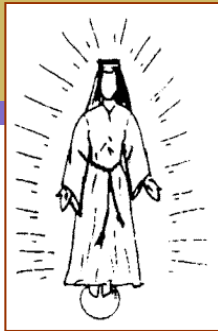
The woman, Israel