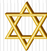
The Remnant of Israel